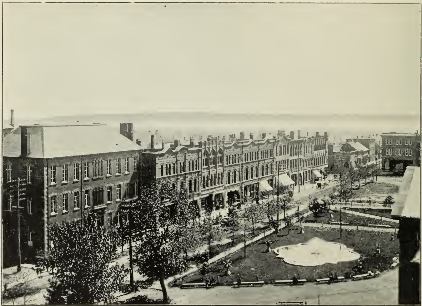
VICTORIA ROW, CHARLOTTETOWN, P.E.I.